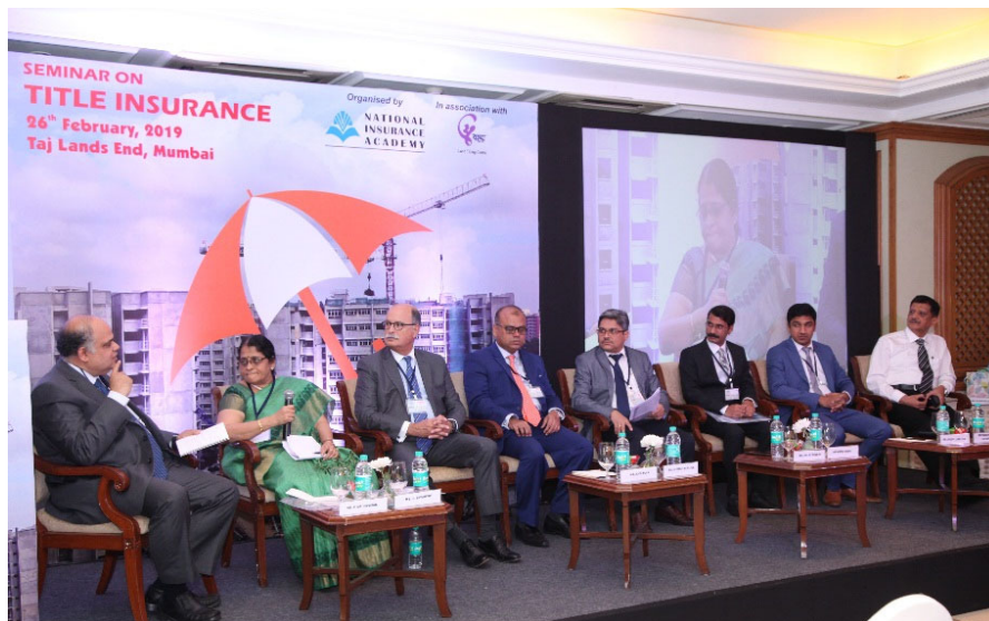
Dignitaries during a panel discussion at the Seminar on Title Insurance, Mumbai