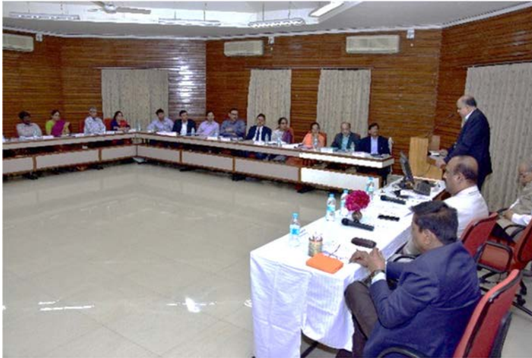
GMs, AGMs and officials of PSU along with Director and Chair Professors of NIA discussing the training calendar