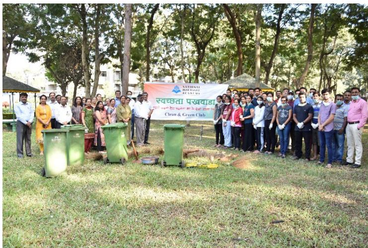
PGDM Students along with NIA officials during the Swachhta Pakhwada at NIA Campus