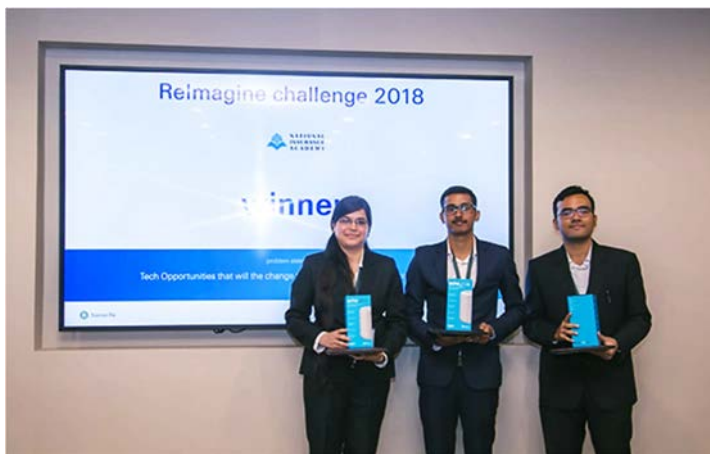
NIA students receiving the award at Swiss Re, Bangalore