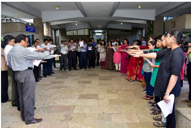
PGDM students, employees of NIA and MDP participants taking the Integrity Pledge