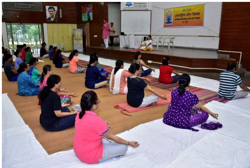
PGDM students, staff members performing Yoga

NIA enthusiastically celebrated the International Day of Yoga on 21 st June 2018. The staff members, and MDP Participants attended the session in large scale. PGDM students who were doing internship in Pune also participated.