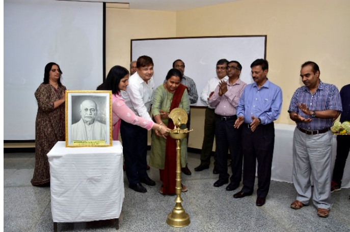
Celebration of Rashtriya Ekta Divas by employees of NIA

Rashtriya Ekta Diwas (National Unity Day) was celebrated on 31 st October 2018 to pay tribute to Sardar Vallabhbhai Patel, who was instrumental in keeping India united. PGDM students organized a video of the Iron Man of India which highlighted his contribution to India.